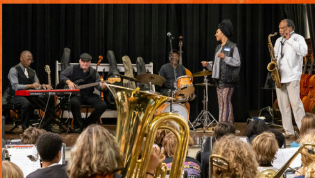
Oaktown Jazz® at Edna Brewer Middle School, Oakland

Oaktown Jazz Workshops aims to cultivate the next generation of jazz musicians as well as appreciation for jazz music in the community at large. To that end, we bring live music and presentations on jazz history and influence to schools and libraries. In 2023, we performed at 10 East Bay libraries and made 56 visits to East Bay Schools.